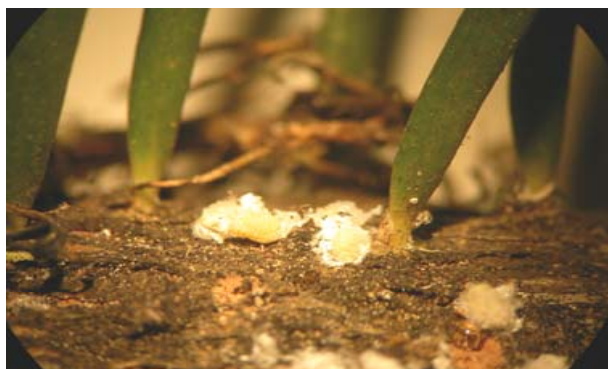
Figure 1. Individuals of M. hellenica established on fir tree. (In colour at www.bulletinofinsectology.org ).

The main purpose of this study was to examine the establishment of the coccid on fir forest, a new habitat for the insect, with two different ways and to collect possible honeydew honey obtained from M. hellenica (figure 1). Additionally, for having a more complete overview, a comparison with Greek ( M. hellenica ) honeydew honey from pine trees and Greek (other coccids) honeydew honey from fir trees was carried out.